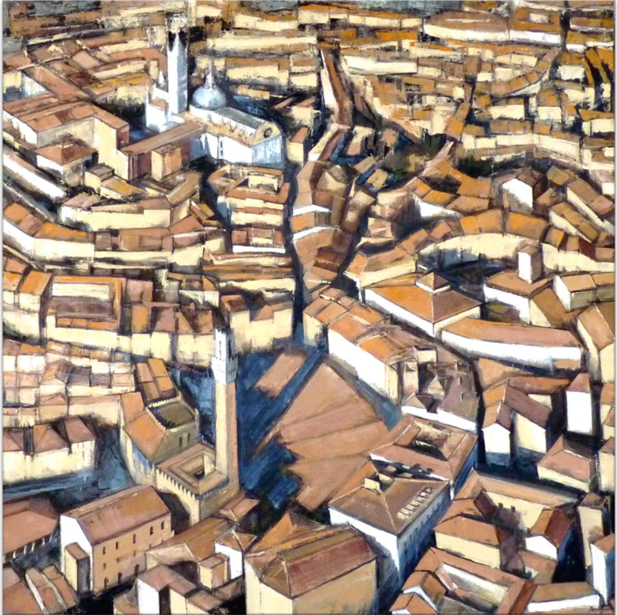
SIENA (ITALY) – Oil on canvas - 101 x 101 cm

« Light is the great protagonist of his works, a strong light that impresses and simplifies the forms »