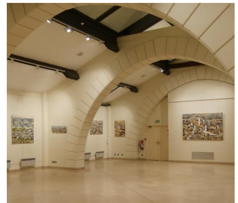
Exhibition at the Carré à la Farine -- 2017