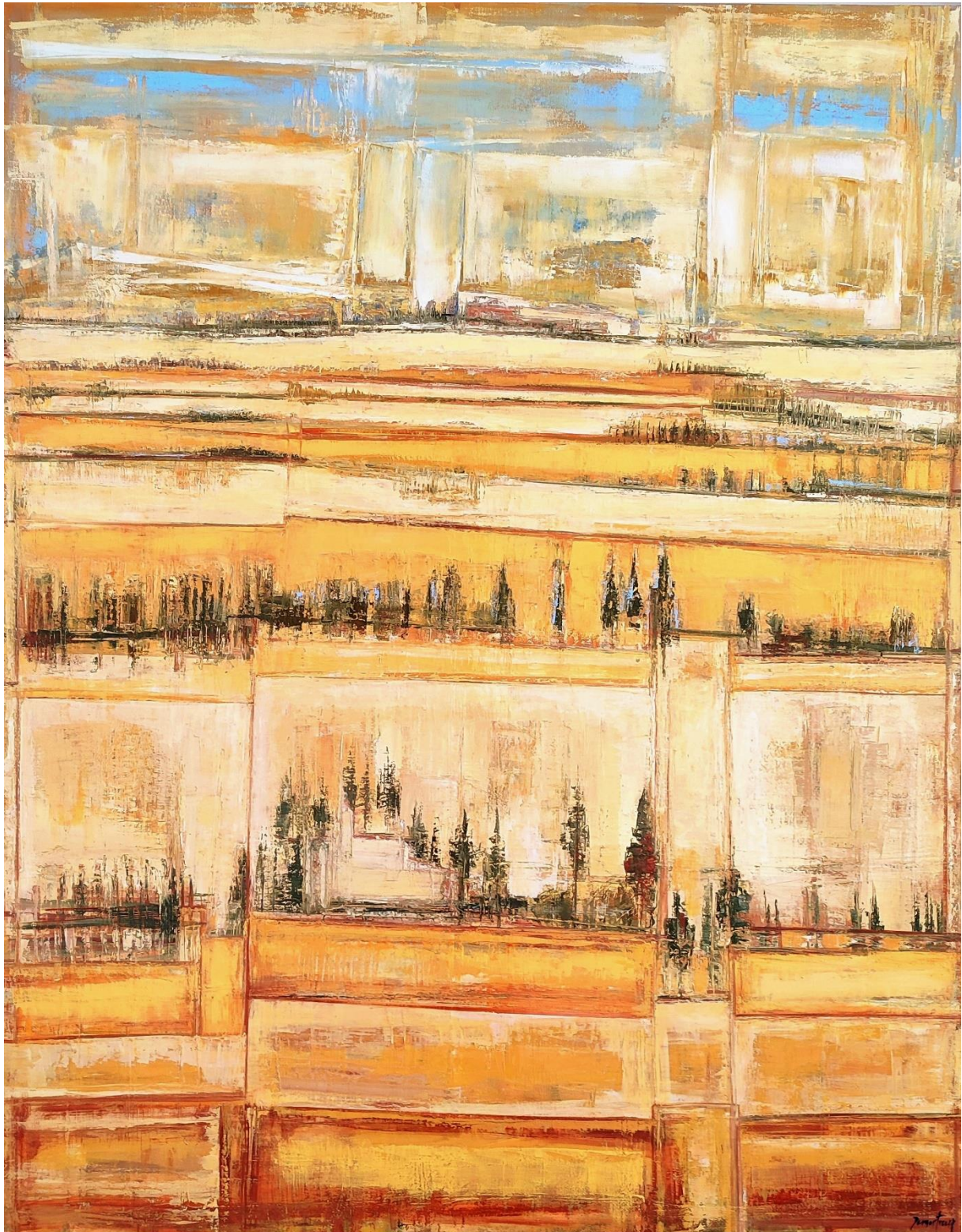
TOSCANA (ITALY) – CIPRESSI - Oil on canvas – 146 x 114 cm