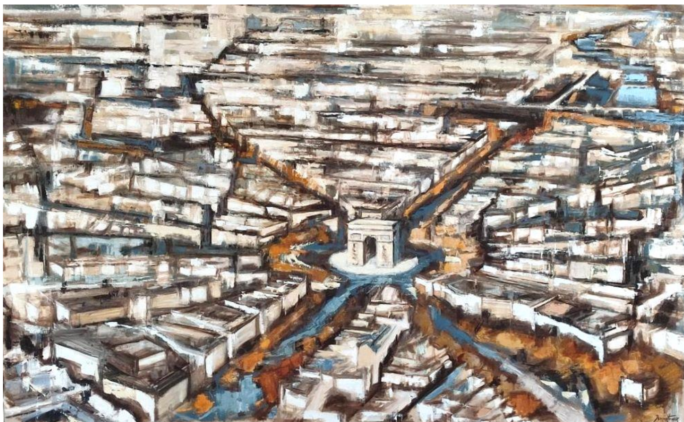
PARIS – PLACE DE L'ÉTOILE – Oil on canvas - 130 x 81 cm