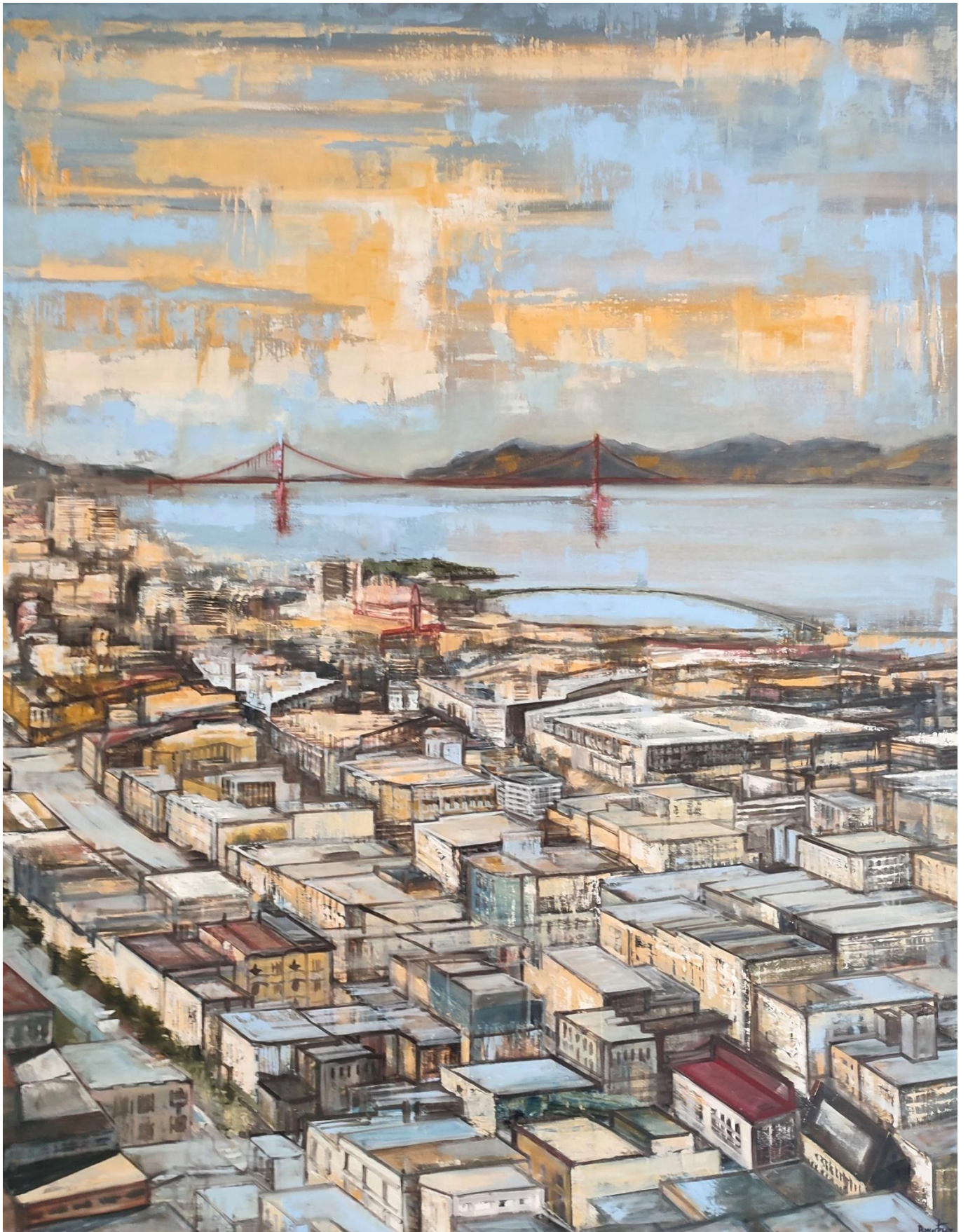
SAN FRANCISCO – Oil on canvas - 114 x 146 cm