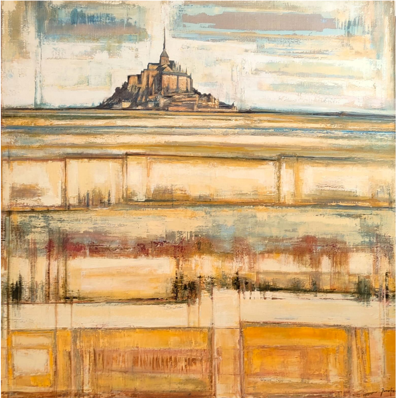
MONT SAINT MICHEL – Oil on canvas – 100 x 100 cm