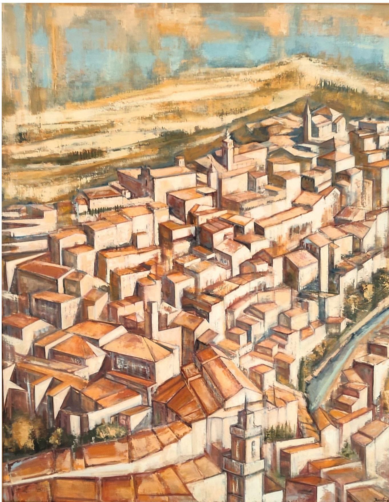
SICILIA- RAGUSA- Oil on canvas - 145 x 115 cm