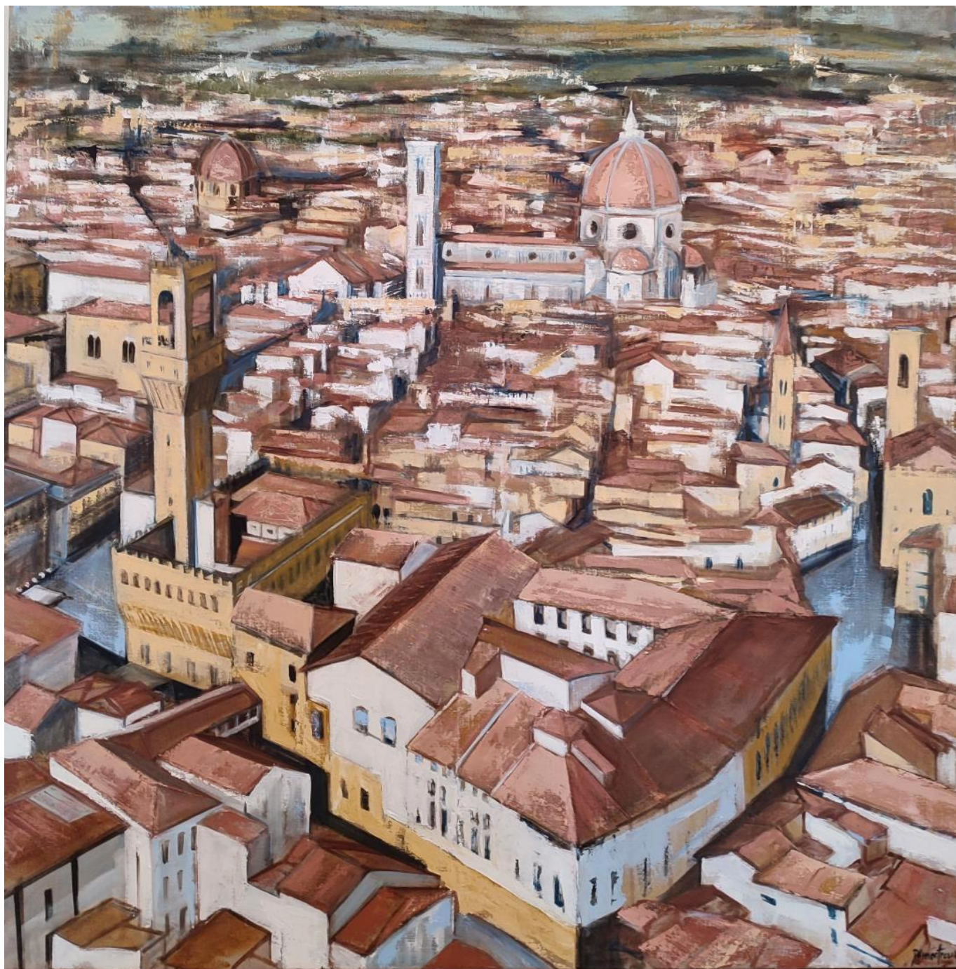
FIRENZE (ITALY) – Oil on canvas - 100 x 100 cm

« I am interested in the void between forms; I try to define a consistency for this that is as real as the tangibles elements »