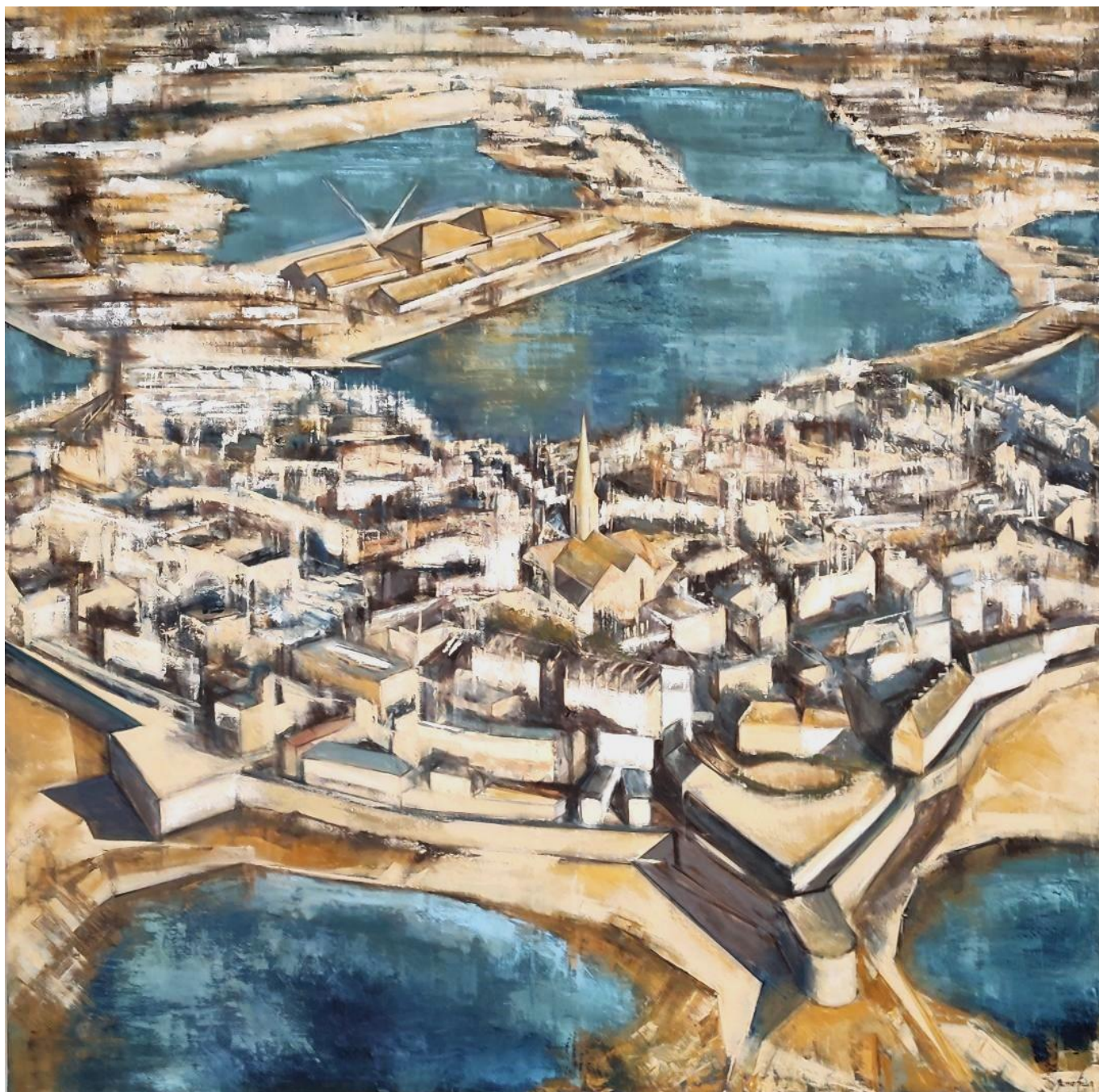
COTE D'EMERAUDE – Oil on canvas - 120 x 120 cm