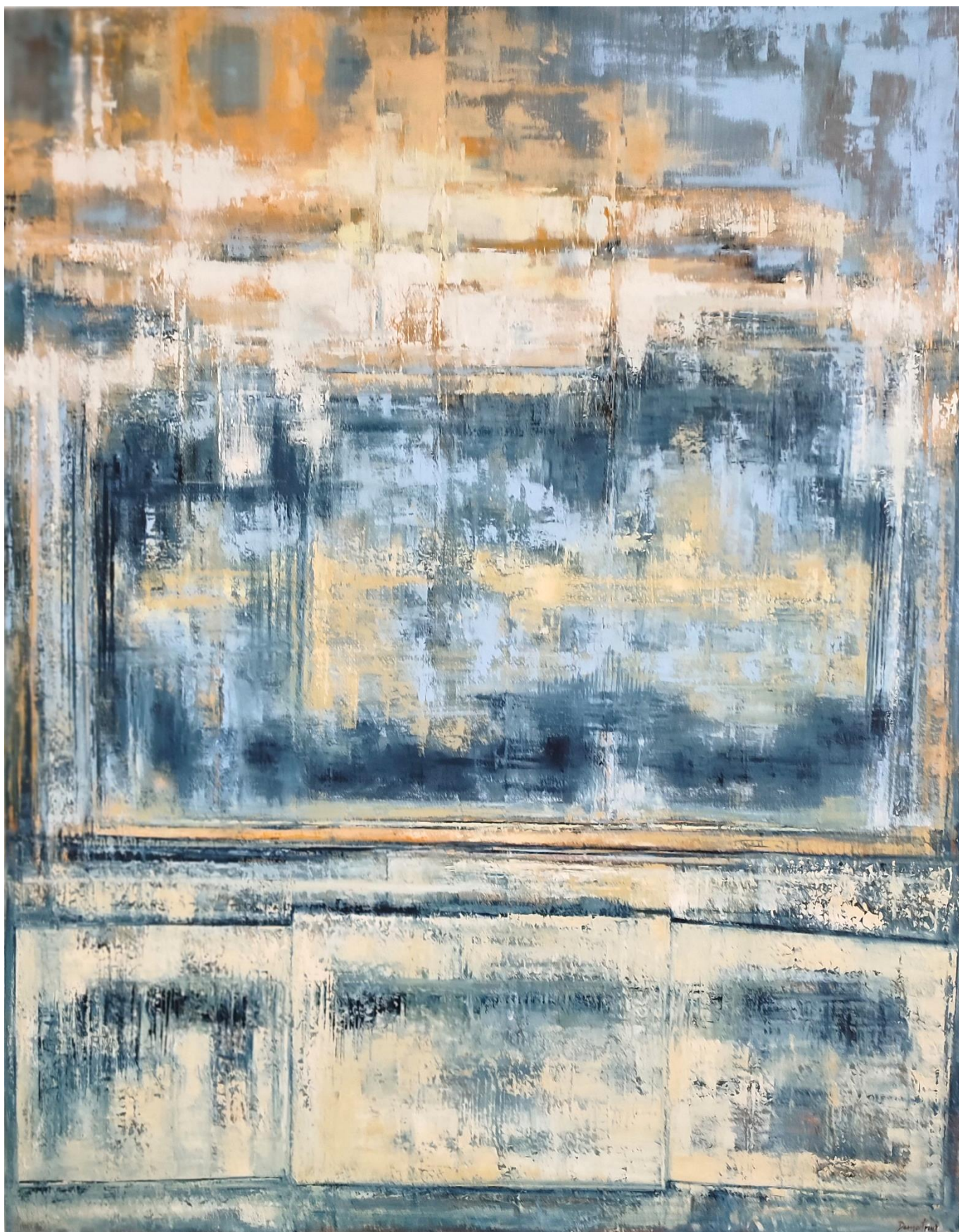
SCINTILLEMENT – Oil on canvas - 146 x 114 cm