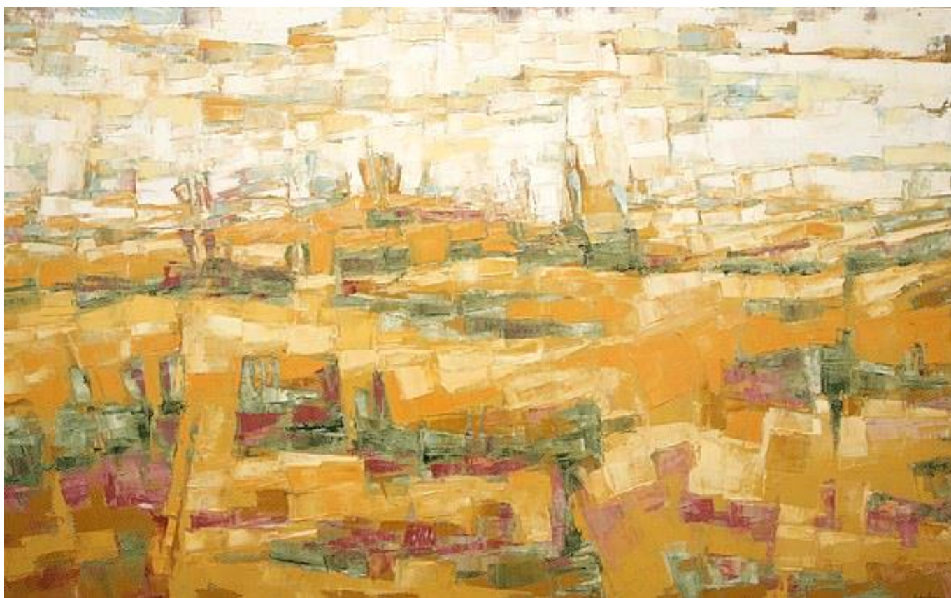
PROVENCE (France) – Oil on canvas - 130 x 81 cm